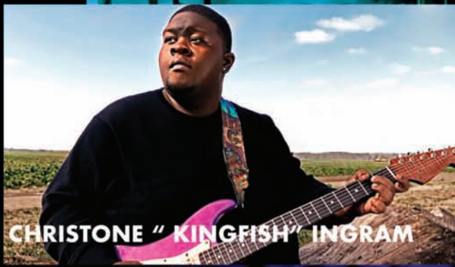
CHRISTONE "KINGFISH" INGRAM