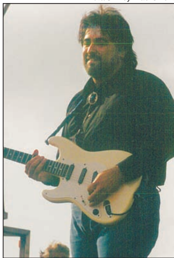
Coco Montoya performing with John Mayall & The Bluesbreakers, 1996 Kansas City Blues Fest

"Guitar Woman" is a tribute to women guitarists Memphis Minnie, Sister Rosetta Tharpe, Maybelle Carter and others.