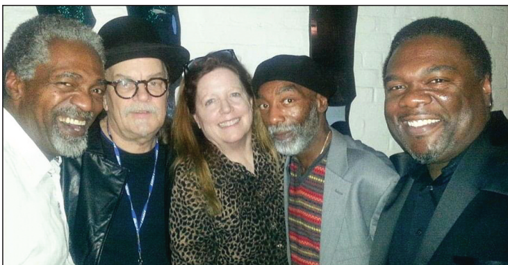
6 Big City Rhythm & Blues • April-May 2024